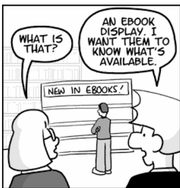
UNSHELVED by Gene Ambaum & Bill Barnes

A new page on our library site discusses how to apply the principles of fair use when using copyrighted electronic resources (such as journal articles, e-book chapters, and images/media from subscription databases and the free Web) in educational settings. Take a look at http://www.mid.muohio.edu/library/fairuse.htm